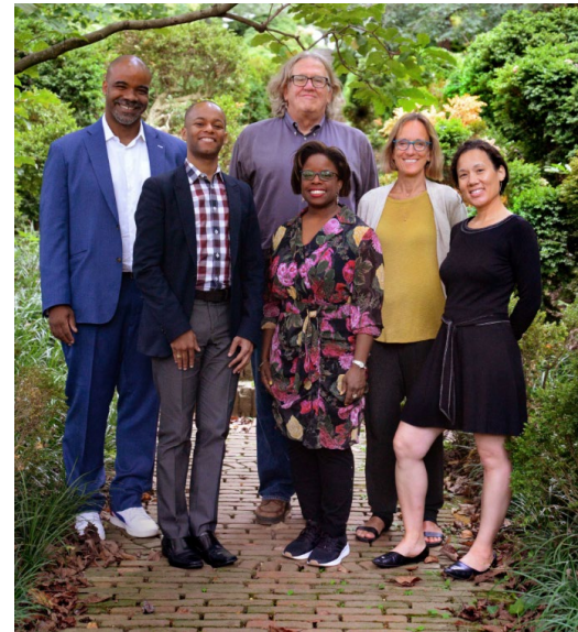
Mellon Advisory Board, Fall 2019

This year we will be hosting a series of Midday Dialogues as well as a number of conversations that build on the democracy theme. Our Fall Colloquium, “Interpreting Landscapes of Enslavement” is one such