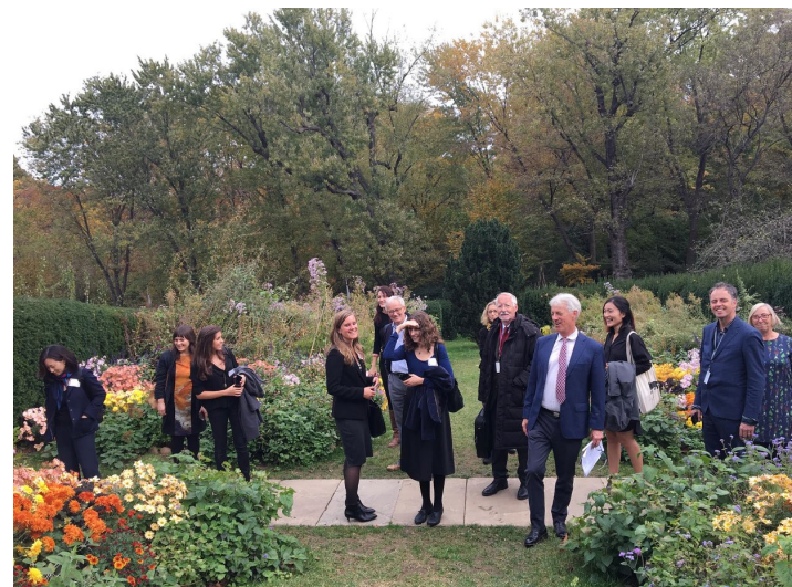
Botanical Gardens and the Urban Future colloquium, Nov. 2018