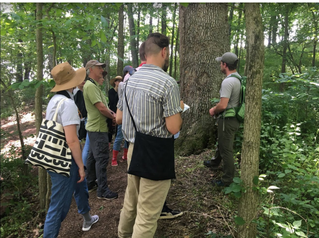
Garden and Landscape Studies Graduate Workshop, with field trip to Oak Spring Garden Foundation, May 2019

Foundation. Intended to develop the field of garden and landscape studies across different disciplines and to promote the depth and breadth of future landscape scholarship, the workshop brought together early-career scholars and practitioners pursuing cross-disciplinary research on landscape-related topics. During morning sessions, participants were invited to share among themselves selected aspects of their work; afternoon discussions focused on key issues and texts in landscape history and theory, situating garden and landscape design in the context of humanities scholarship, from the idea of the Three Natures to the ecological challenges of the Anthropocene and the discourse of landscape urbanism. The program also included two study sessions in the Rare Book Reading Room at Dumbarton Oaks, site visits in the Washington