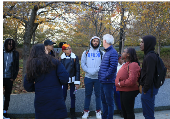
Field trip with students from Phelps Architecture, Construction and Engineering High School, on the landscape design and social and cultural history of the National Mall, November 2018