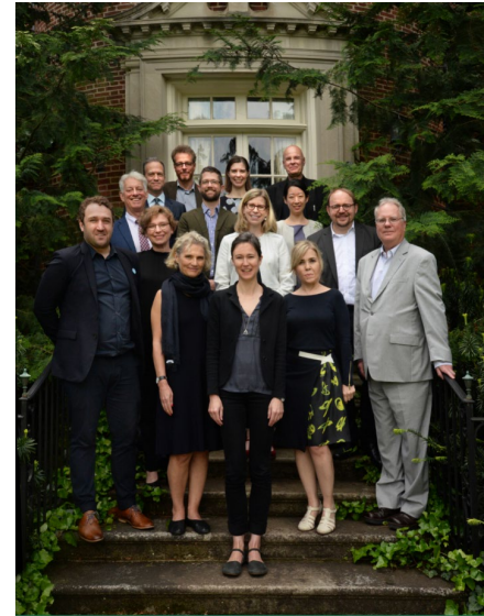
Symposium Speakers: Landscape, Sport, Environment, May 2019

Throughout history, organized sports and sport-like activities have had considerable impact on how we design and understand landscapes. Correspondingly, designed and pre-modern “natural” landscapes have contributed to the formation and development of new sports and cultures of movement and the body. Even within landscape and environmental histories, sport landscapes have been conspicuously absent, although some of the first such spaces were part of designed gardens, parks, cities, rural and wilderness areas. The symposium sought to address this lack of knowledge, exploring the design of different sport and recreational landscapes over time and how they have given expression to various understandings of nature and culture.