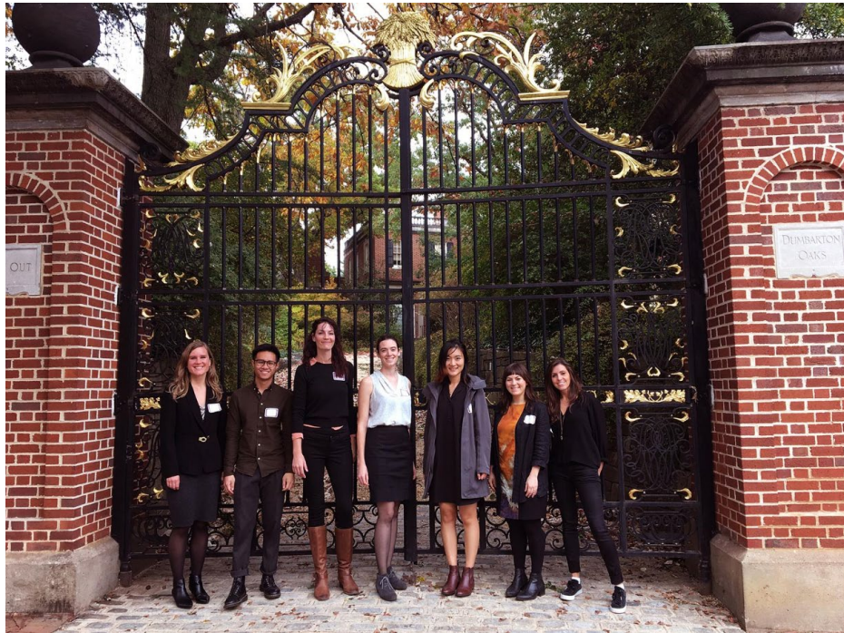
Student Colloquium Award recipients, November 2018